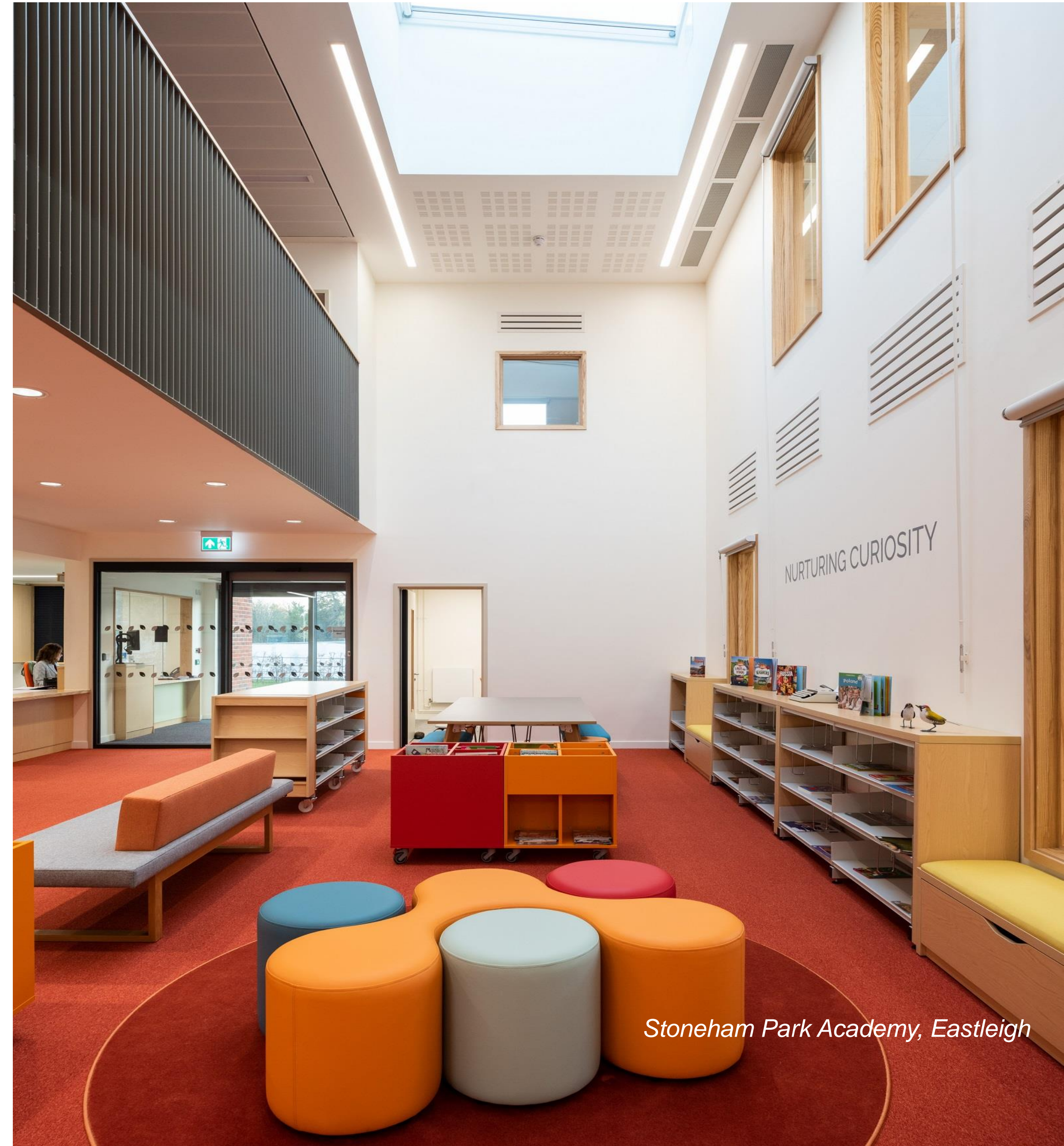
Stoneham Park Academy, Eastleigh