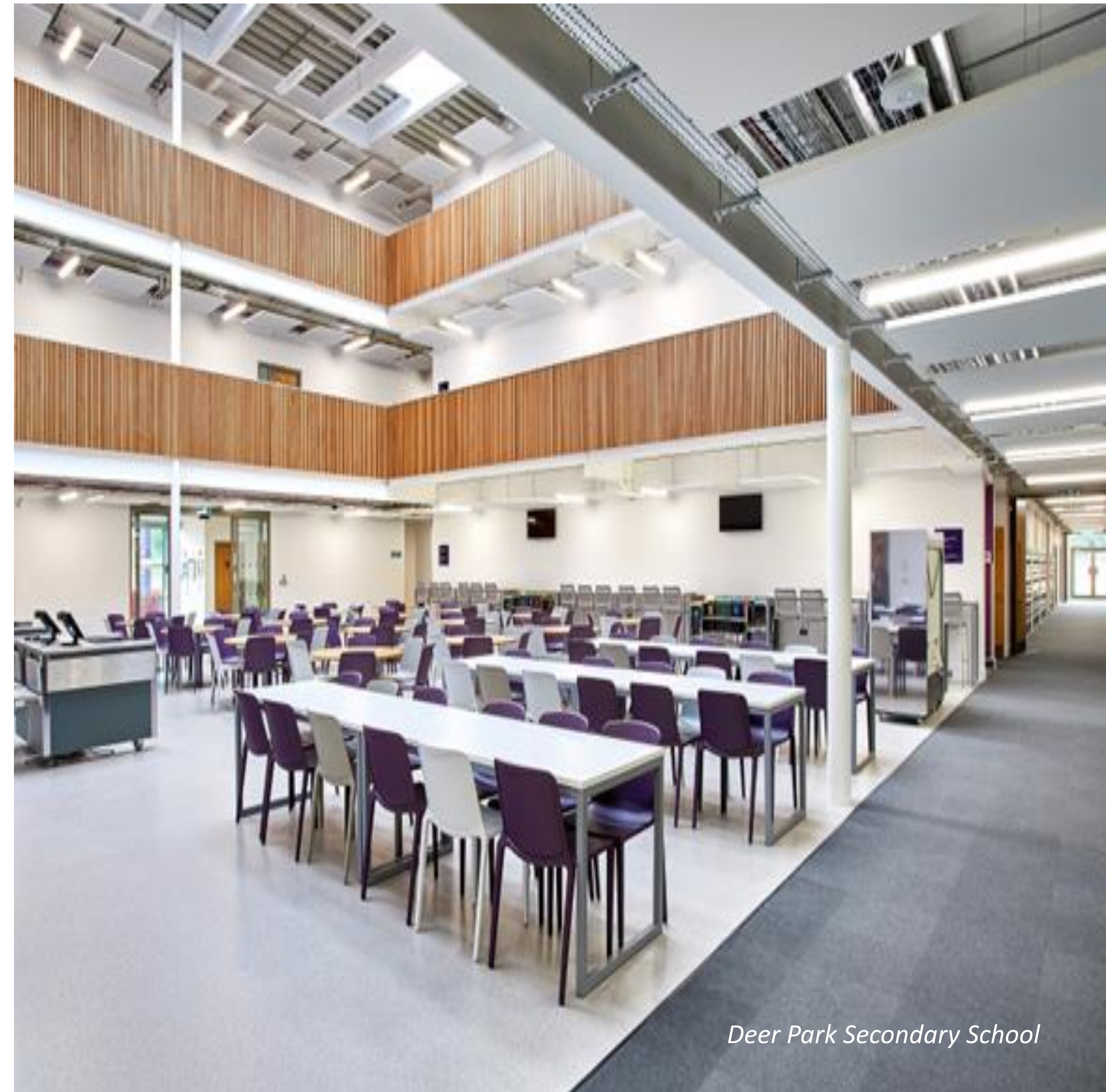
Deer Park Secondary School