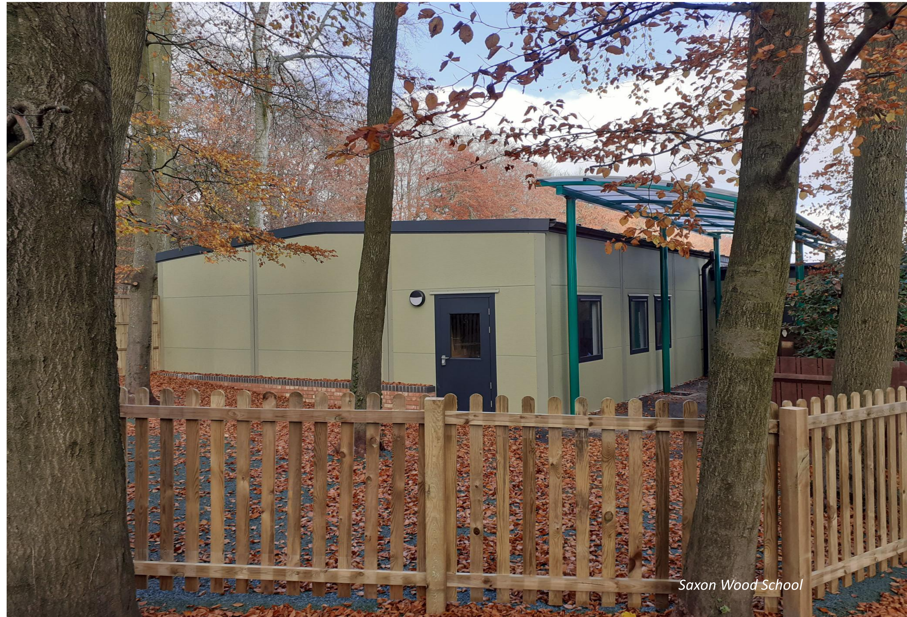
Saxton Wood School