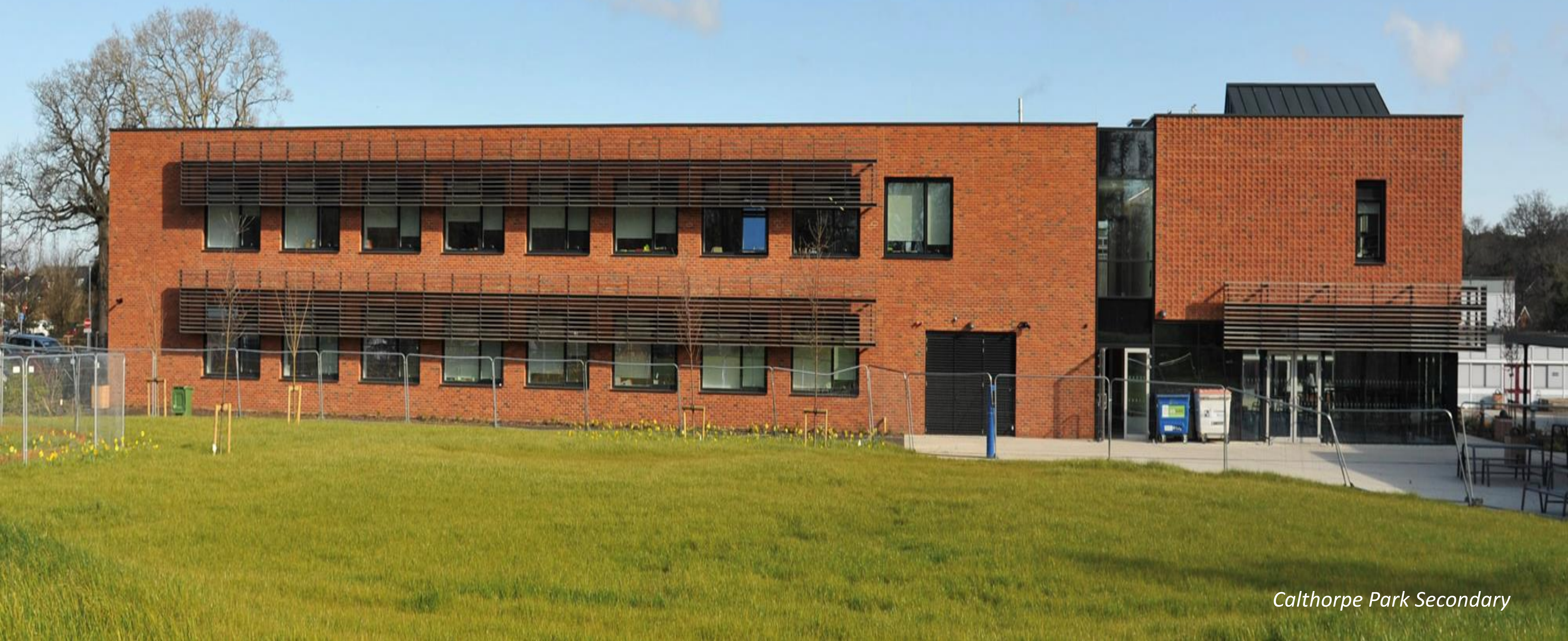
Calthorpe Park Secondary