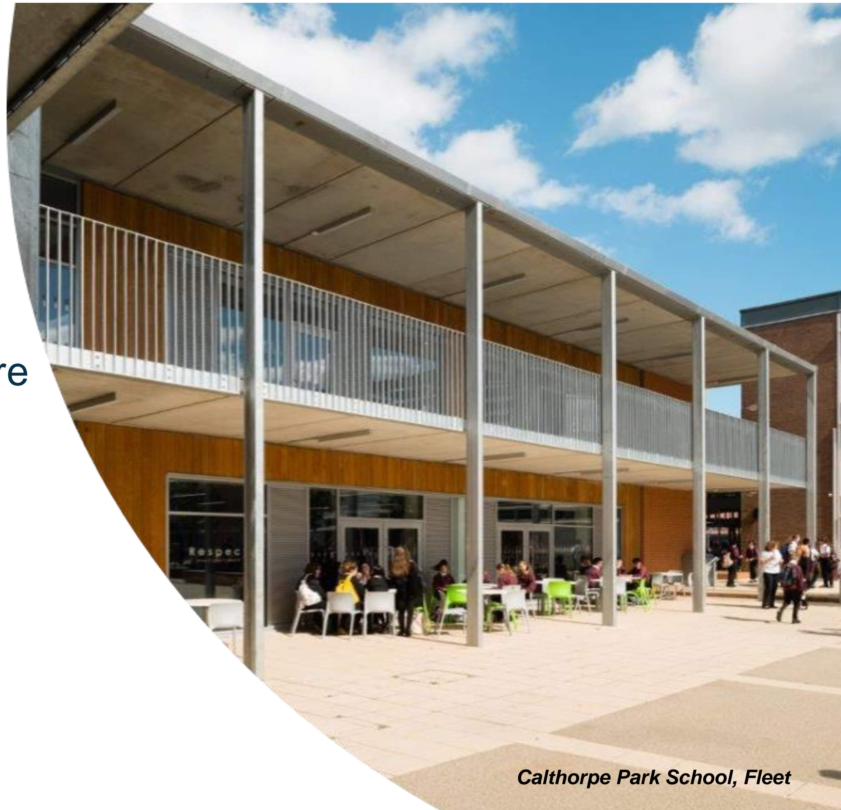
Calthorpe Park School, Fleet